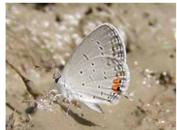
Eastern tailed-blue 1", Jul-Sep Everes comyntas GG, OH, FG