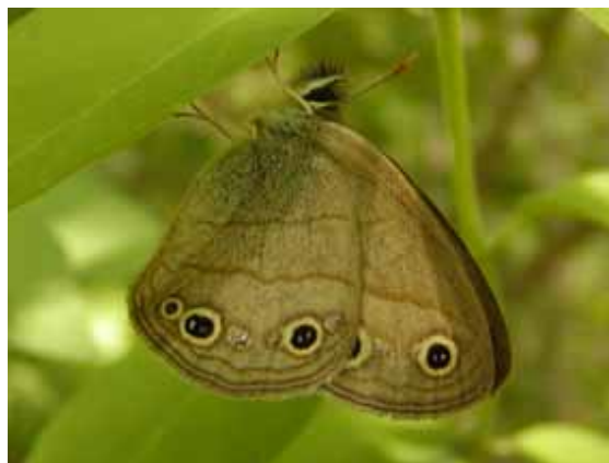
Little Wood-satyr Megisto cymela 1.75", May-Jul OH, OGP