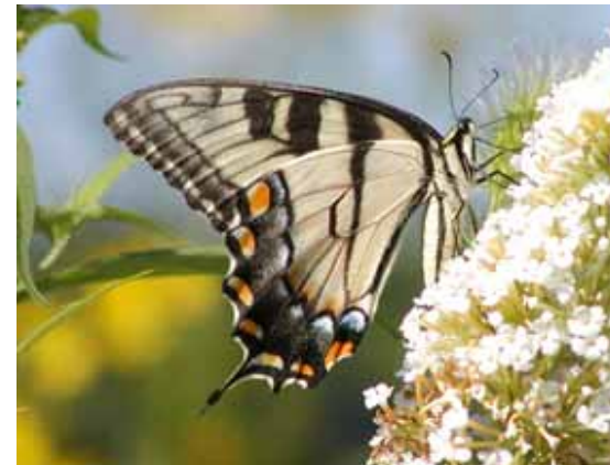
Eastern Tiger Swallowtail 5", Apr-Sep Papilio glaucus GG, OH