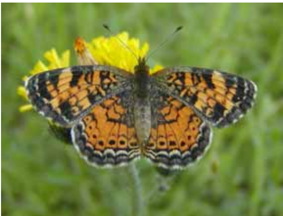
Pearl Crescent Phyciodes tharos 1.5", Jul-Sep GG, OH, SMT, FG