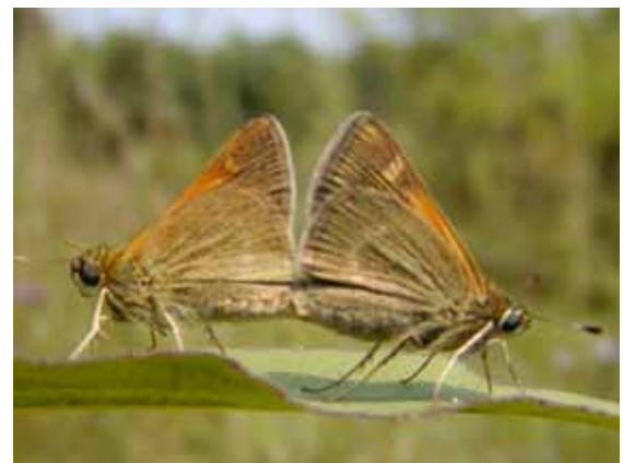
Tawny-edged Skipper Polites thermistocles 1.25", May-Aug OH