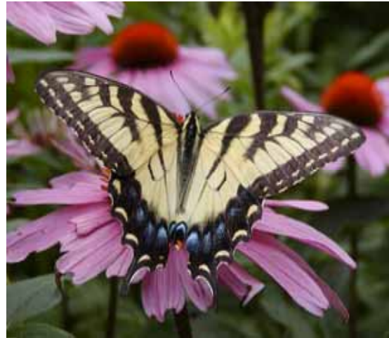
Eastern tiger swallowtail

A guide to common butterflies and skippers found at the Institute of Ecosystem Studies.