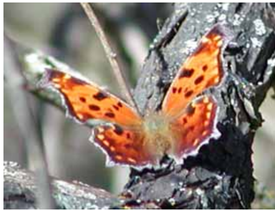
Eastern Comma Polygonia comma 2.25", Apr-Sep WCT, OGP