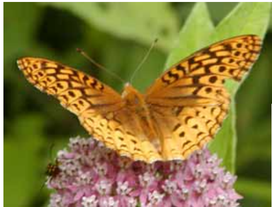
Great Spangled Fritillary Speyeria cybele 3.5", Jun-Sep OH, GG, FG