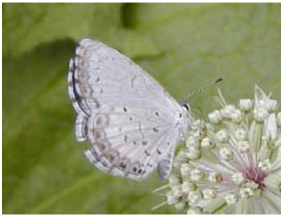
Spring Azure Celestrina ladon 1", Apr-Sep FG, GG, OH