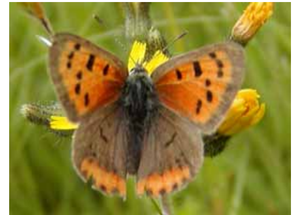
American Copper 1", May-Oct Lycaena phlaeas SMT, OP