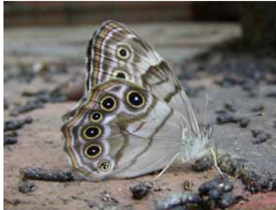
Northern Pearly-eye Enodia anthedon 2.5", Jul-Aug OGP, WCT