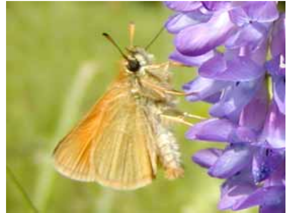
European Skipper Thymelicus lineola 1", Jun-Jul OH, GG, SMT