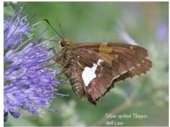
Silver-spotted Skipper Epargyreus clarus 2.25", May-Sep OH, GG