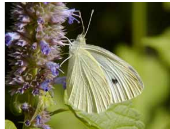
Cabbage White 2", Apr-Oct Pieris rapae Everywhere