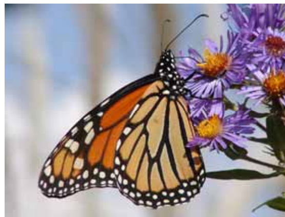
Monarch Danaus plexippus 4", Jul-Oct