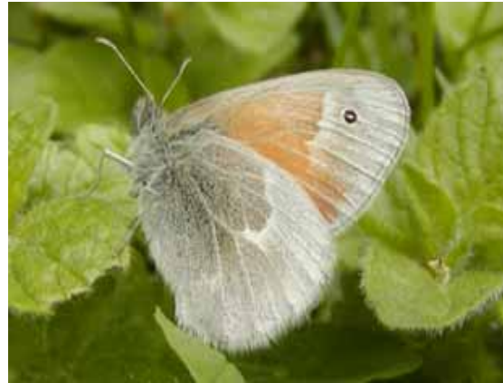
Common Ringlet Coenonympha tullia 1.25", May-Sep