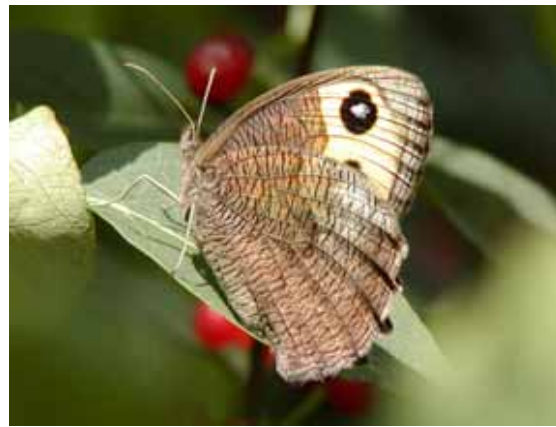
Common Wood-nymph Cercyonis pegala 2.5", Jun-Sep OH, OGP, SMT