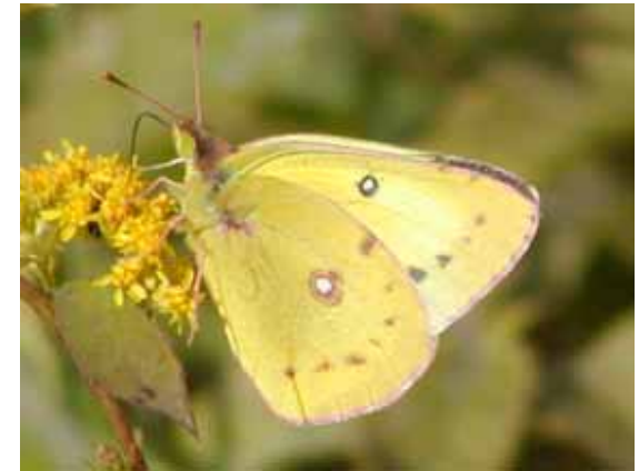
Clouded Sulphur 2", Apr-Oct Colias philodice Everywhere